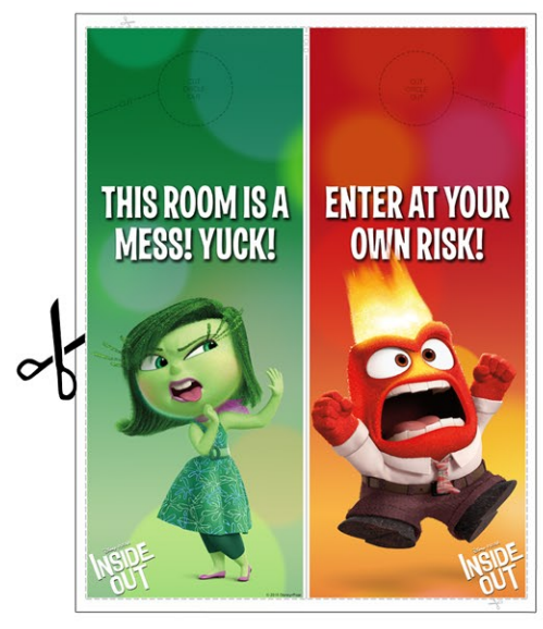
STEP 1: CUT ALONG THE DOTTED LINE ON THE FOLLOWING THREE PAGES.

MAKE THIS SIMPLE DOOR HANGER AND SHOW PEOPLE HOW YOU'RE FEELING